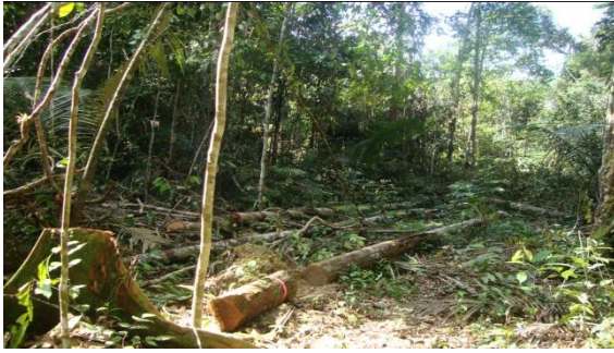
Figure3. Even if the logging is conducted with care, it means a certain disturbance to the forest