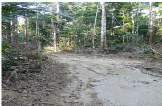
Figure2. Soil compaction and serious injury of the vegetation in the Central Amazon caused by heavy machinery (Picture source: Kunert N.).

These steps can limit damage to the surrounding forest, cut erosion of topsoil, enable faster recovery of the forest, and reduce the risk of fire [30,31]. RIL results in a sharp reduction of residual damage to the forest [19,32,33]. A study in Borneo, showed that 41% of the remaining trees that were not harvested were crushed by either falling lumber or tractors under CL regimes. This residual damage could be reduced to 17% by applying RIL practices[32]. The application of RIL in tropical regions has increased in recent years as it is a criterion for timber certification under the Forest Stewardship Council (FSC). Certified timber achieved top level timber prices, however currently accounts for only 5% of timber produced in global market[34].