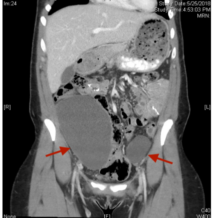
Figure 1. Computed tomography of abdomen seven weeks prior to presentation with no evidence of cysts. Figure 2. Computed tomography of abdomen showing multiple peritoneal inclusion cysts in the pelvic cavity (arrows).